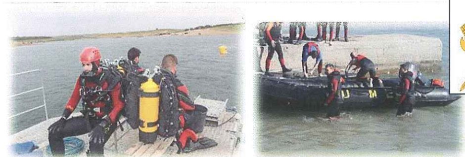
BÚSQUEDA MARTA DEL CASTILLO (FEB09)