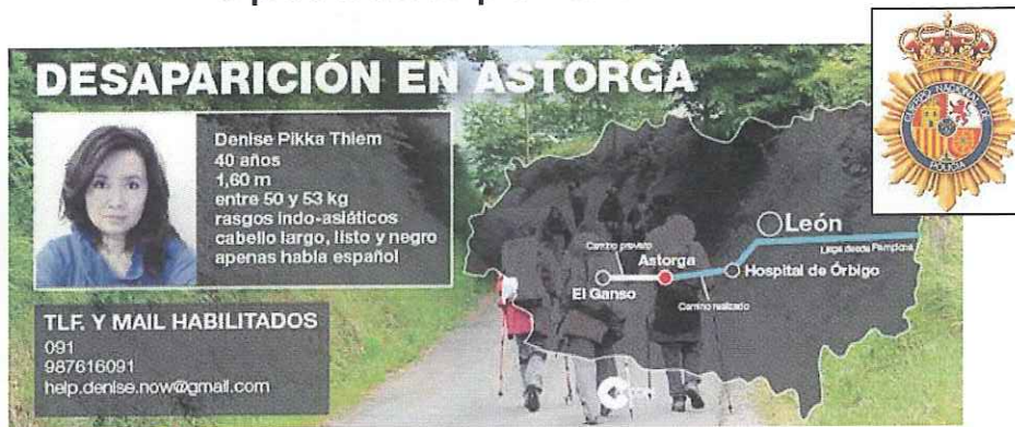
BÚSQUEDA PEREGRINA EN ASTORGA (SEP15)