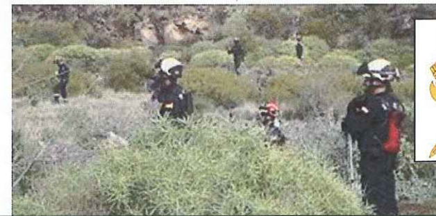
ByR ANCIANO EN GRAN CANARIA (DIC16)