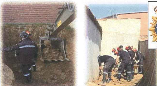
BÚSQUEDA MATADEON DE LOS OTEROS (MAR16)